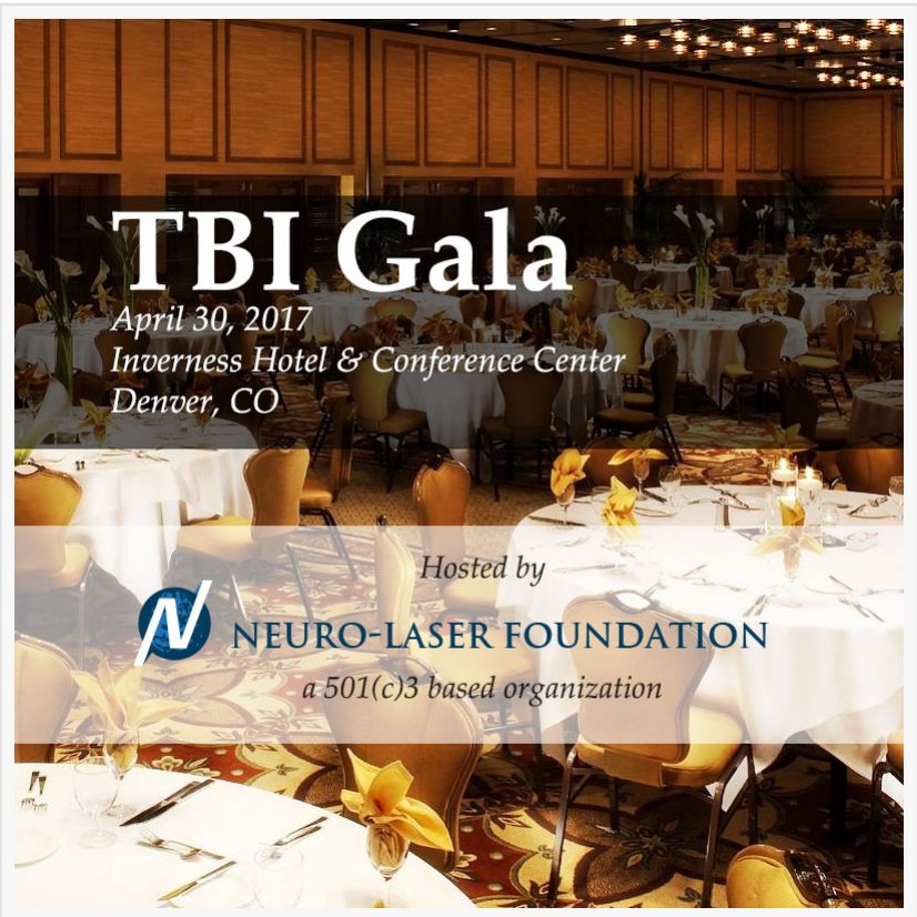
TBI GALA, hosted by Neuro-Laser Foundation, will raise funds and awareness for a promising new treatment for the "untreatable" epidemic: TBI.