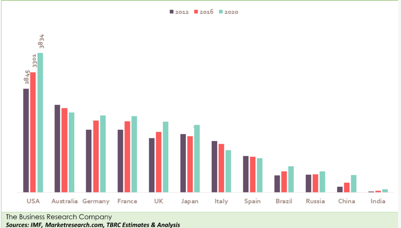
Global Hospitals and Outpatient Care Centers Market, Per Capita Average Hospitals and Outpatient Care Centers Expenditure, By Country, 2012, 2016 And 2020,