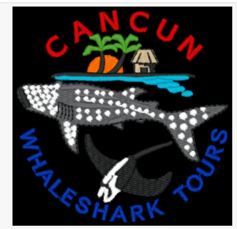
Cancun Whale Shark Tours

Reservations are now being accepted online @ <a href="https://www.cancunwhalesharktours.com">www.cancunwhalesharktours.com</a> or by calling USA Direct 305-433-7523