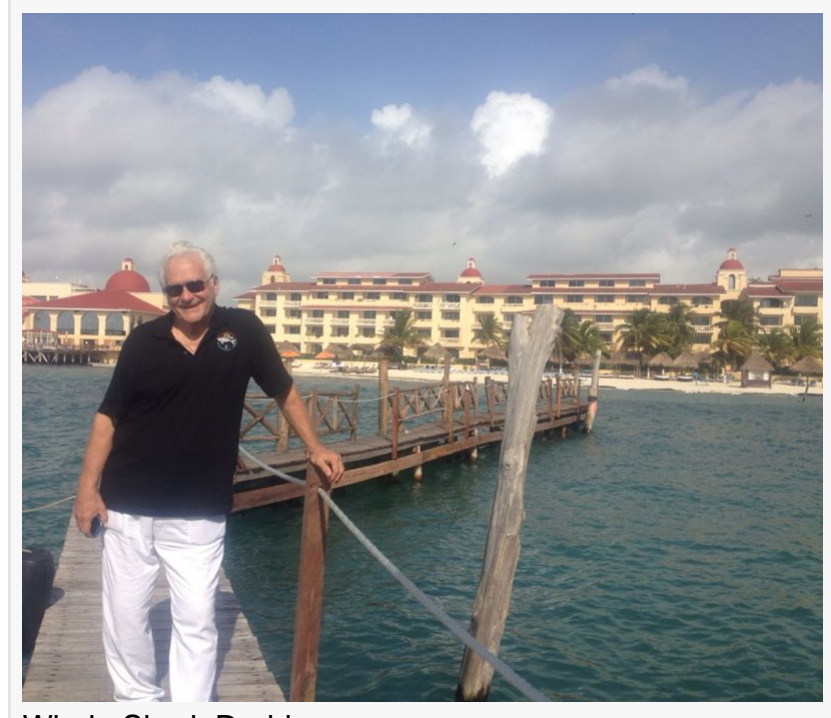
Whale Shark Daddy

Mother Natures Aquarium is also teeming with other amazing sealife. Most days guests will observe Giant Manta Rays, Turtles, and Pods of Free Running Dolphins in addition to snorkeling with the Whale Sharks.