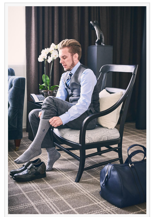
Height Increasing Shoes

As a brand, GuidoMaggi accommodates a unique clientele, specifically the modern gentleman seeking to increase his height, style and self-confidence. GuidoMaggi's clients settle for nothing less than superior quality and absolute