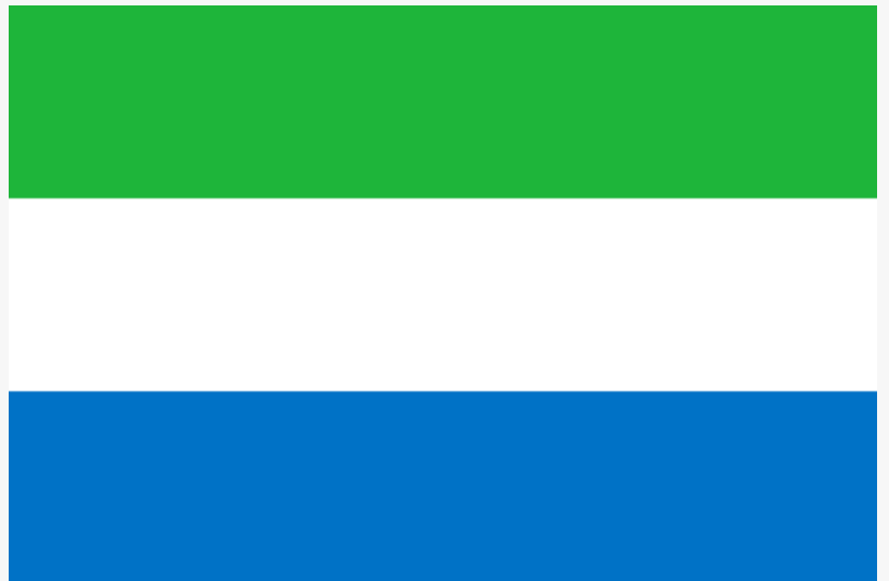
Sierra Leone Flag