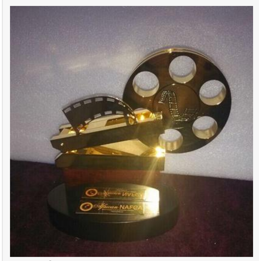
The NAFCA Trophy

The awards include: The NAFCA Film Awards -32 categories, The NAFCA Honors -10 categories and Nollywood & African People's Choice Awards -32 categories of competition in the film, humanities,