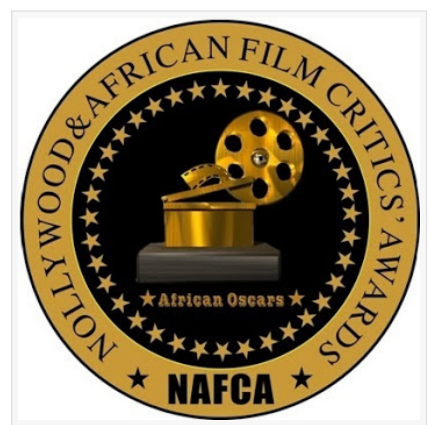
Nollywood & African Film Critic's Award Logo

The NAFCA and The NAFCA Honors are awards of merit and are considered the highest African film and honorary awards. The mission for the NAFCA is to improve the African cinema by connecting Africa to the rest of the world. The NAFCA Special Honors was presented for the first time in 2011 to President Nelson Mandela.