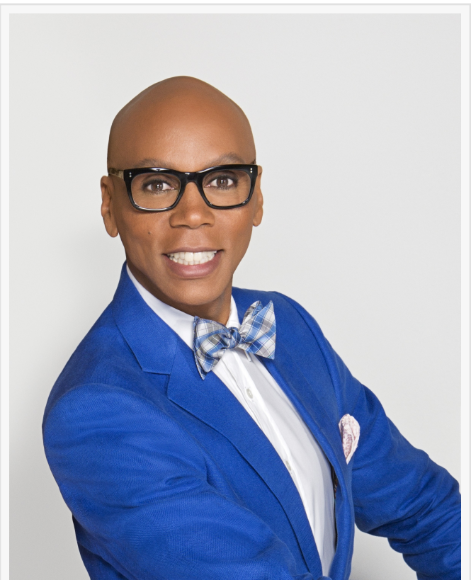
RuPaul interviews Andy Cohen about his latest book "Superficial."