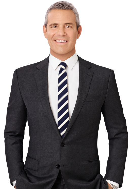
Andy Cohen discusses his new book "Superficial" on December 1 in Santa Monica

Cohen is the popular host and executive producer of "Watch What Happens: Live," and executive producer of "The Real Housewives" franchise. He also hosts Bravo's highly rated reunion specials. He tours nationally with Anderson Cooper on "AC2," hosts "Then & Now with Andy Cohen" on Bravo and "Radio Andy" on Sirius XM. He has won an Emmy and two Peabody Awards for his work. The author of two New York Times bestsellers, "Most Talkative" and "The Andy Cohen Diaries," he lives in New York City with his dog Wacha. The new memoir "Superficial" (Harry Holt and Company, November 15, 2016) is a follow-up to Cohen's 2014 bestseller "The Andy Cohen Diaries: A Deep Look at a Shallow Year."