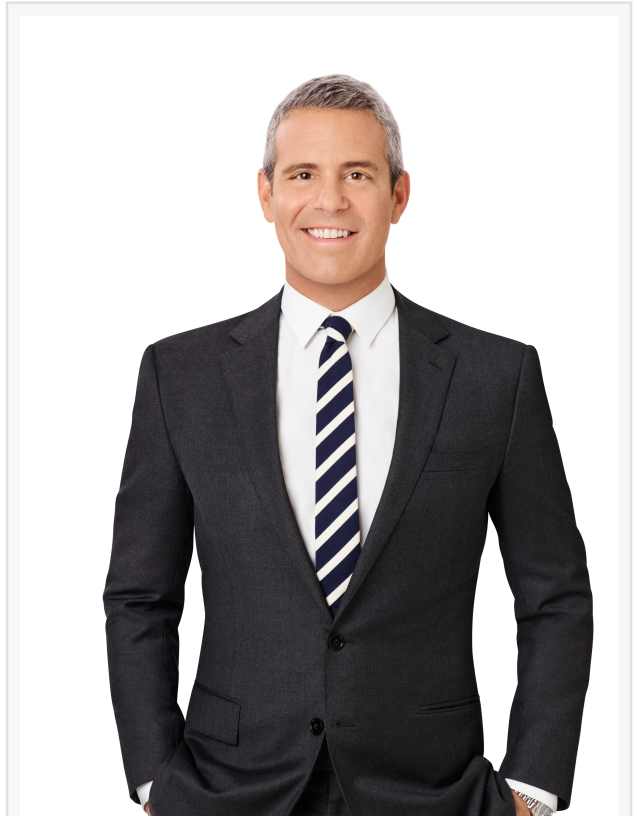
Andy Cohen discusses his new book "Superficial" on December 1 in Santa Monica

Cohen's famous fans include the glitterati of the entertainment world. Of "The Andy Cohen Diaries," Sarah Jessica Parker asked, "I couldn't help but wonder, 'Is Andy Cohen... Carrie Bradshaw?'" Anderson Cooper says it is "the funniest thing I've read all year..." Fellow TV host Jimmy Fallon called "Diaries" "the literary equivalent of a Fresca and tequila."