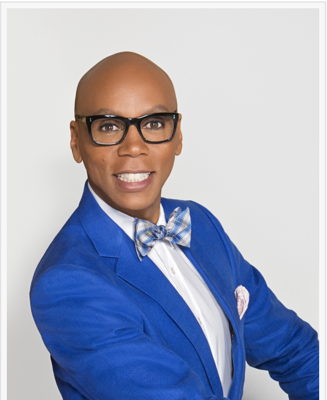
RuPaul interviews Andy Cohen about his latest book "Superficial."