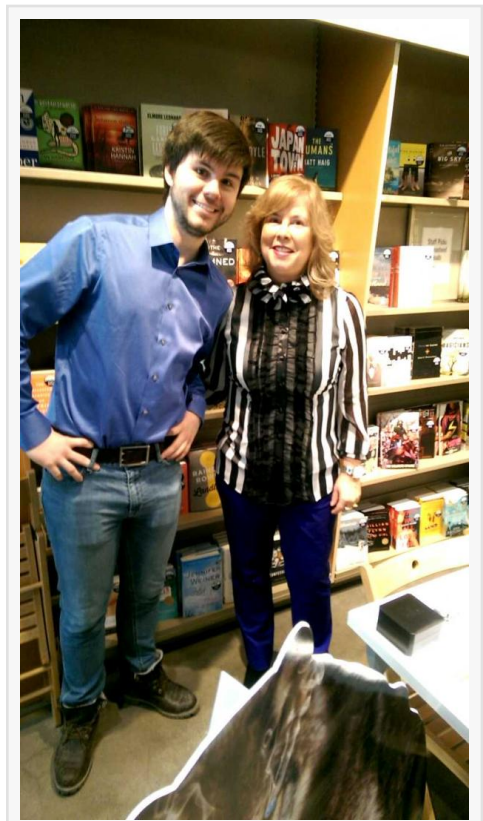
Indigo Eaton Centre Book Signing, March, 2015

This press release can be viewed online at: http://www.einpresswire.com