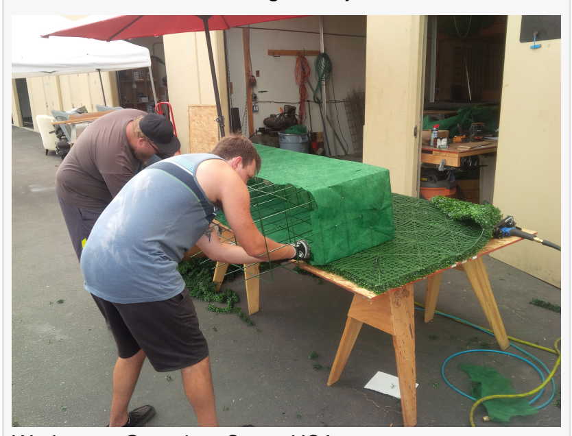
Workers at Geranium Street USA

together, but they must allow individuals to grow up to six plants for their personal use. Local governments can also limit personal marijuana cultivation to indoor only, but some locations will allow growers to plant outdoors, as long as the plants are out of sight.