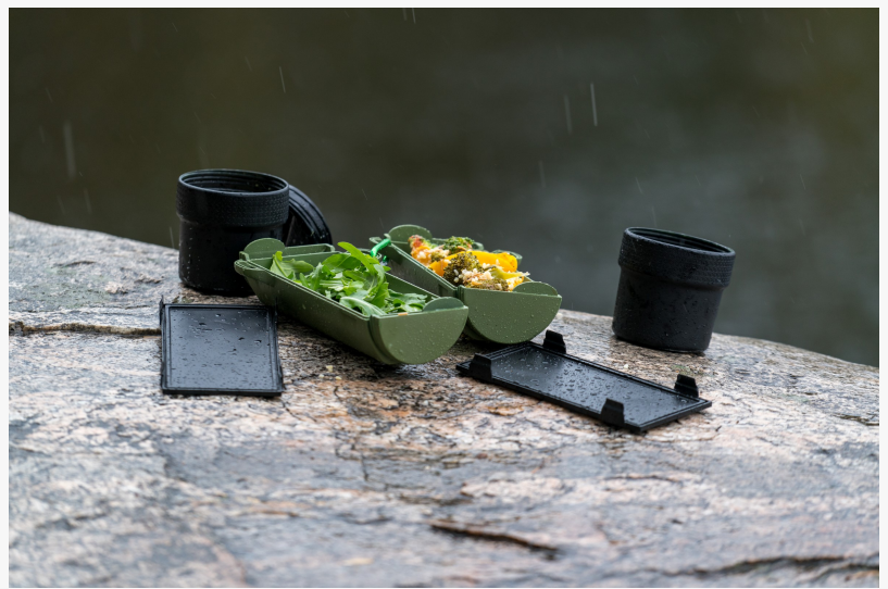
Nice meal wherever you go

Additional features include the usable volume and empty weight printed on each compartment of the container to measure the food you eat or buy pre-made food from a hot bar without paying for the weight of the container. The cashier can know the specs of the container and charge accordingly. It has loops for carabiners or straps and clips for added portability and security.