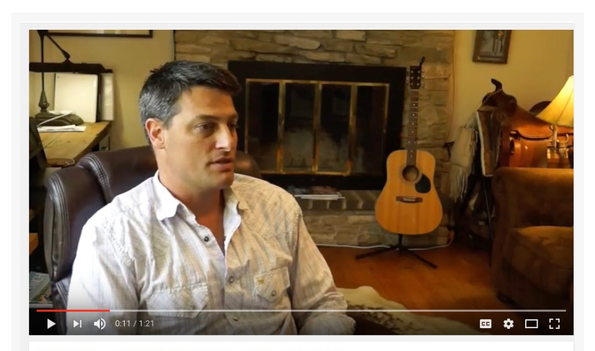
What is the most effective way to market my property?

In addition to posting his own list of 99