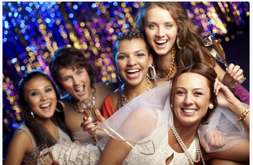
Wedding Day Guidelines for Bridesmaids