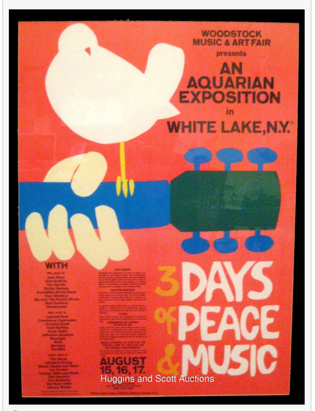
Original Woodstock Poster

This press release can be viewed online at: http://www.einpresswire.com