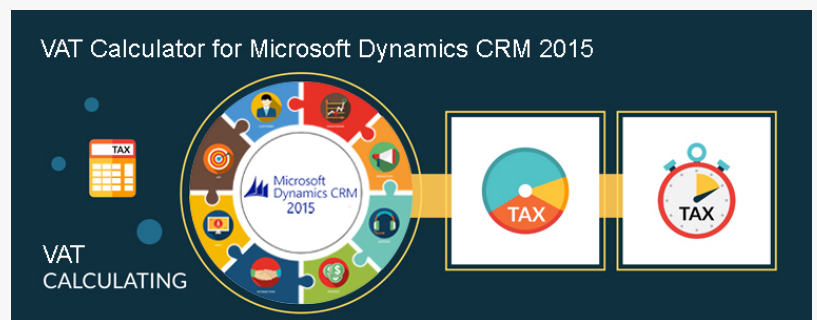
VAT Calculator 2015

This press release can be viewed online at: http://www.einpresswire.com