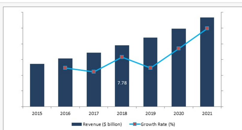
Aerostat Systems Market

In 2015, Americas account around 50% of the market share and is likely to dominate the market in the forecast period. In 2012, US DOD has spent $1.3 billion to develop and acquire numerous aerostats and airships.