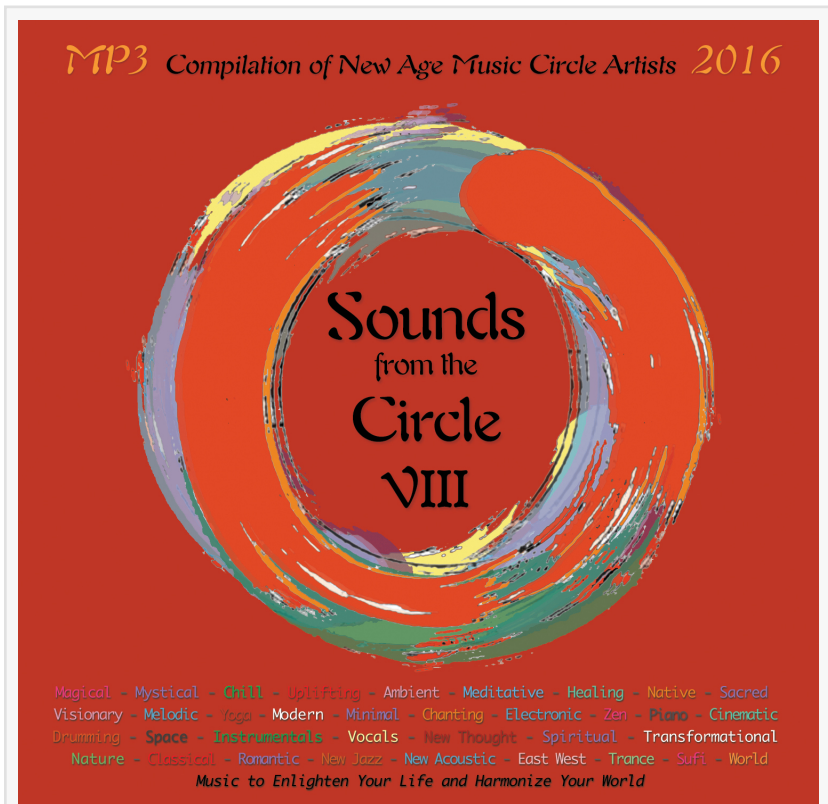
Sounds from the Circle VIII