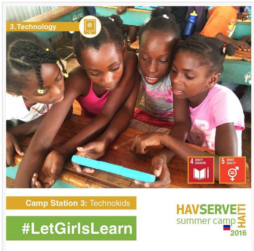
Girls learning at HavServe Summer Camp