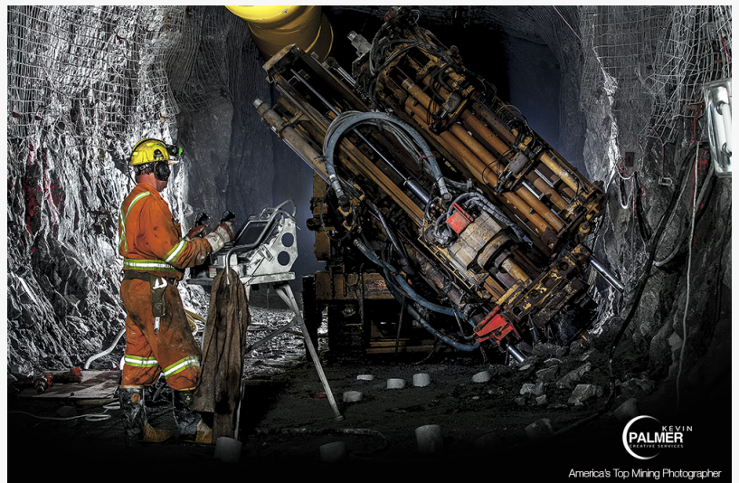
ITH Orion Drill operating in Canada