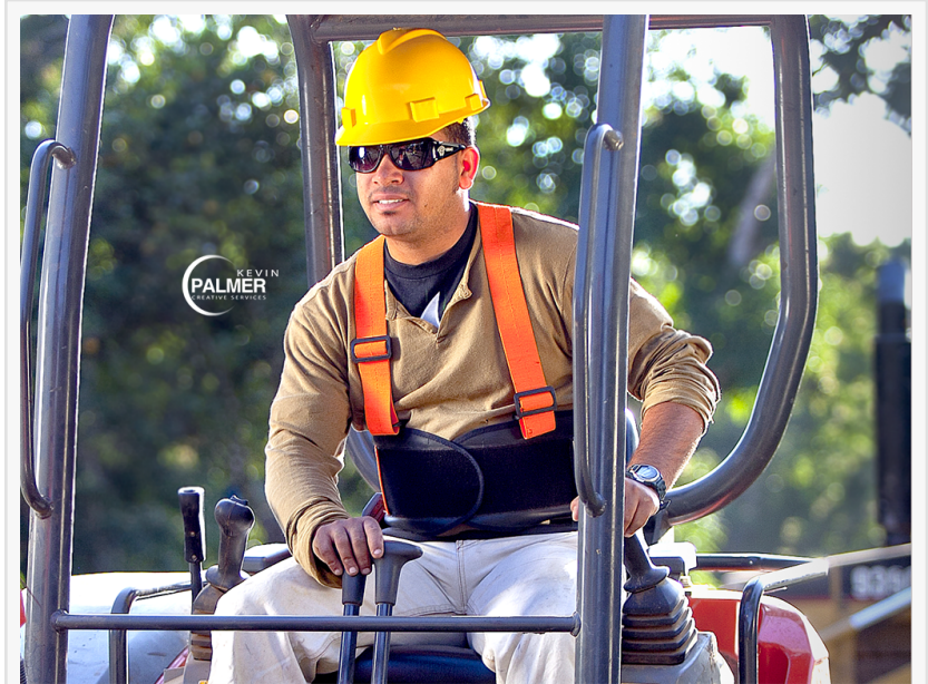
Safety in the Workplace - PPE's, Great Light - and Cool Surroundings