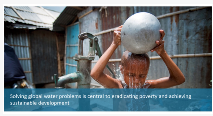
Solving global water problems is central to eradicating poverty and achieving sustainable development