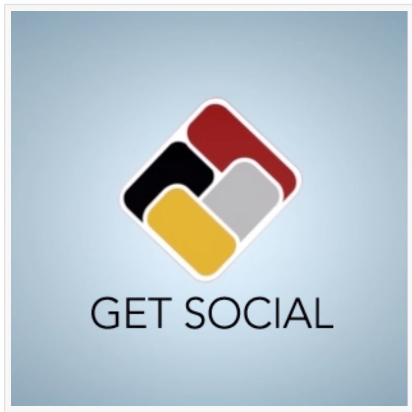
Social Media with Dzine it

Established in 2003, dzine it, inc. is a leader in custom web development, programming and design solutions for small and large business, agencies. The company offers a wide range of business-centered visual communication solutions, including web-based content management, web design, graphic design, custom web software applications, ethical white hat search engine optimization (organic SEO), video encoding, and print media solutions. For more information, call 212.989.0813 or visit www.dzineit.net.