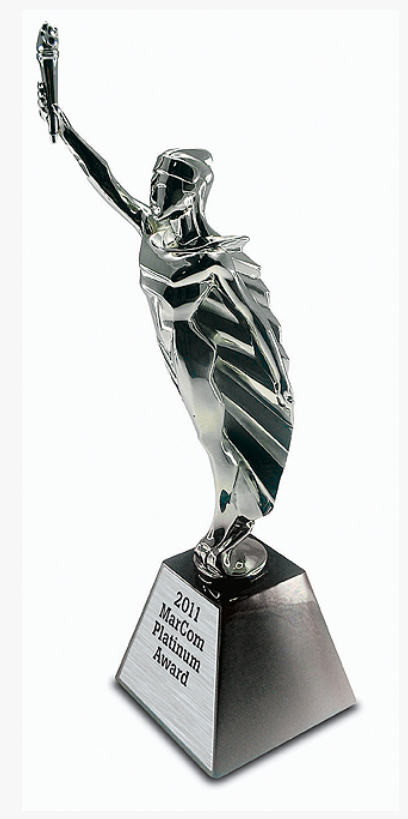
Marcom Platinum Winner dzine it