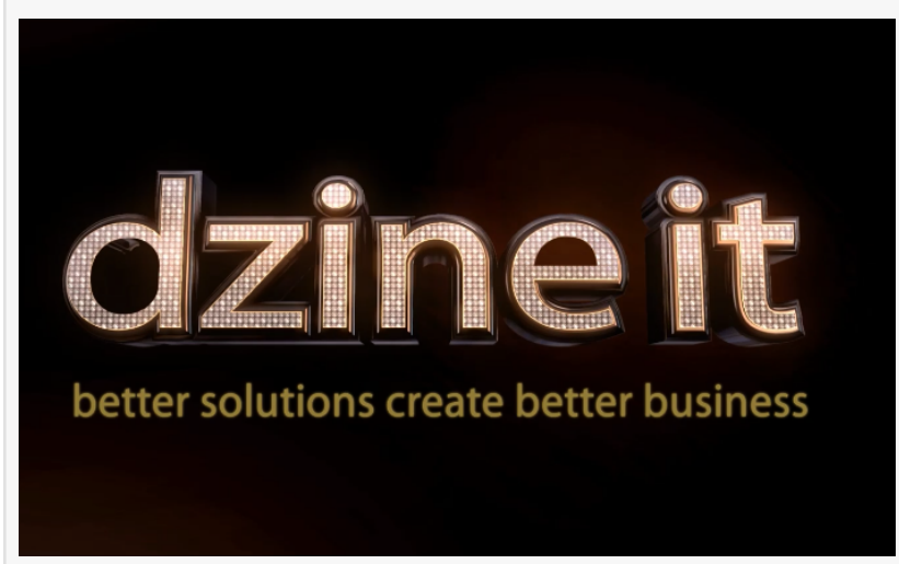
Dzine It Better Solutions for Business