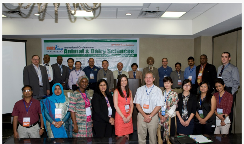
International Conference on Animal & Dairy Sciences 2013

There is a significant rise in the demand for the livestock products among the developing countries due to high